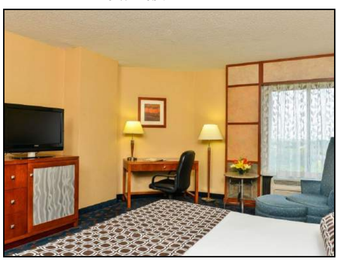
King size Bed