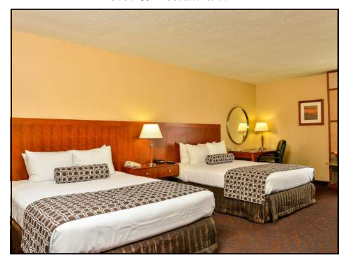
Two Queen Beds