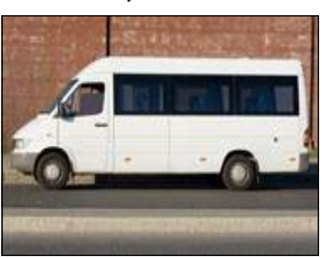
Airport pick up 2H-outside main terminal on far right