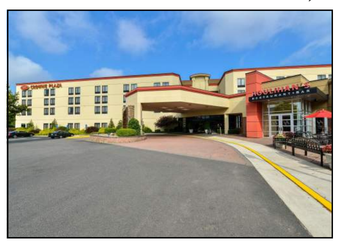
Hotel & Restaurant