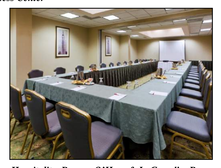
Hospitality Room -O'Hare & LaGuardia Rooms